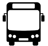
Regional Bus Service