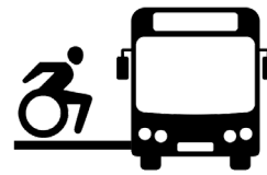
Transit for People with Disabilities, Veterans, and Senior Citizens