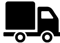
Freight Mobility Projects