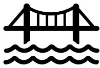
Highway Safety Improvements