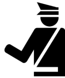
Washington State Patrol