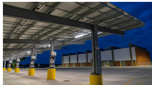
IBEW members are being trained to safely install the electric vehicle charging infrastructure necessary to support the expected EV boom.

The whole world knows that the future of the auto industry is electric. We need to make sure America builds that future instead of falling behind. We should build those vehicles and the batteries to get them here in the United States of America ... I want those jobs here in Michigan, not halfway around the globe. That's what my plan will do. The infrastructure bill will put in motion the union workers on the job installing a national network of hundreds of thousands of charging stations along our roads and highways and communities.