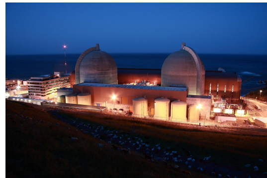
Diablo Canyon in California is among several carbon-free, baseload-producing nuclear power facilities that have closed in recent years.

Not surprisingly, nuclear is the most heavily unionized part of the energy sector and its most diverse. Thirty-six percent of the workforce are women and 34% are people identifying as a racial and ethnic minorities.